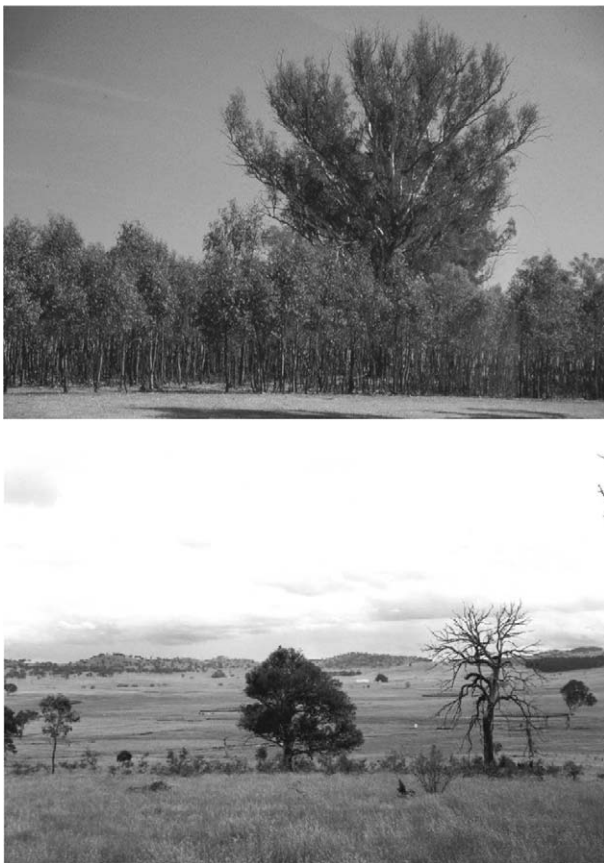
Fig. 3 – Micro-restoration is where tree regeneration is facilitated in the immediate vicinity (<30 m radius) of an existing scattered tree. These examples, from south-eastern Australia, show what micro-restoration might look like (top photo by D. Lindenmayer, bottom photo by A. Manning).